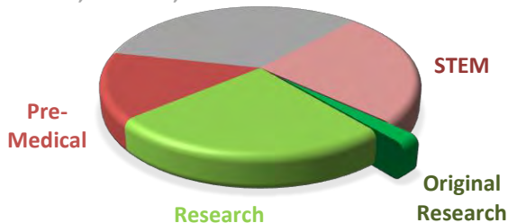
FIGURE 3: AVERAGE PROGRAM COST

College Prep, Enviro, Nano, Forensic, Paleo